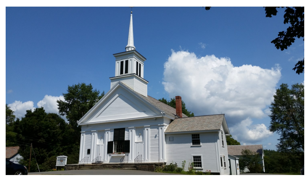
Bev's family appreciates your presence today and all the expressions of sympathy and love.