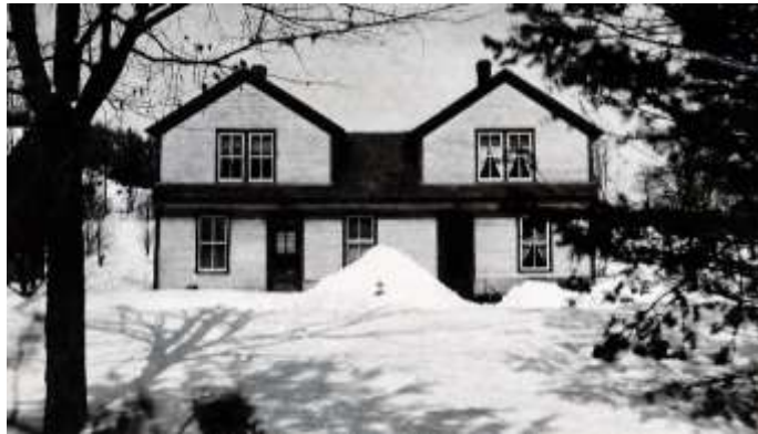
1940's image of olde Buckland Post Office