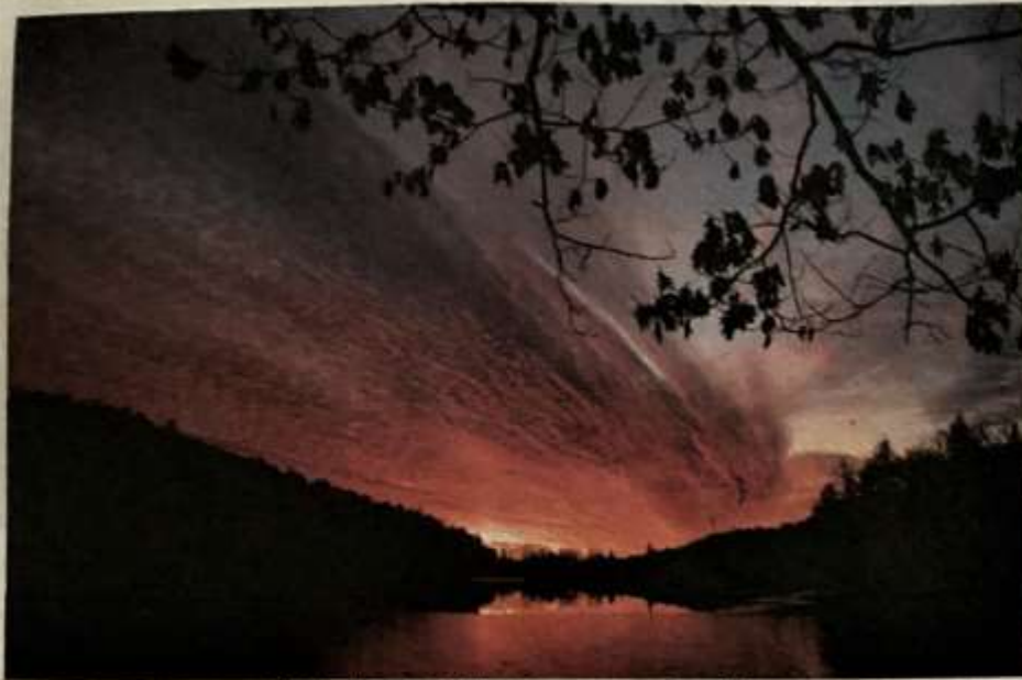
"My Lord, What a morning!"

sunrise over Ashfield Lake 12/15/2021