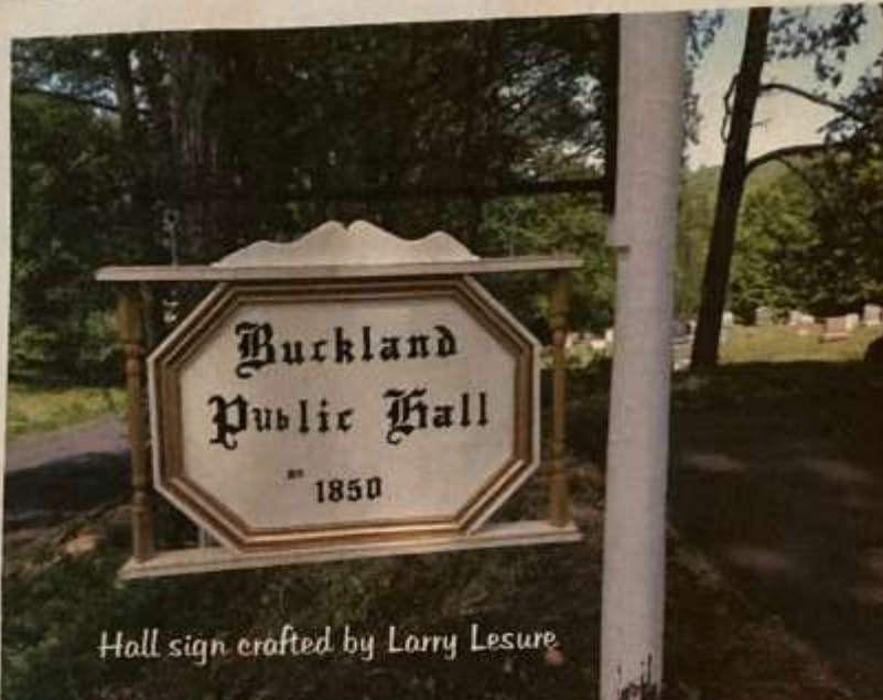
Hall sign crafted by Larry Lesure

The Mary Lyon Church First Congregational Church of Buckland 17 Upper Street P.O.Box 87 Buckland MA 01338 Church 413-625-9440 Pastor 413-634-5451 www.marylyonchurch.org info@marylyonchurch.org September 2021