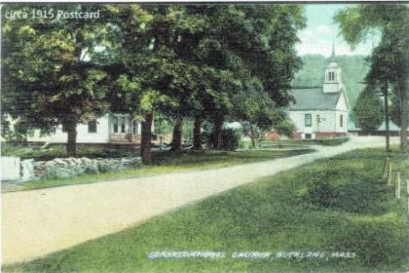
CONGREGATIONAL CHURCH BUCKLAND, MASS.

The Mary Lyon Church First Congregational Church of Buckland 17 Upper Street P.O.Box 87 Buckland MA 01338 Church 413-625-9440 Pastor 413-634-5451 www.marylyonchurch.org info@marylyonchurch.org March 2021